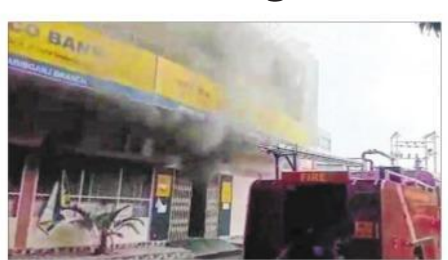
Fire at UCO bank premises in MPBSE campus, Board Office Square

Chest branch of UCO Bank (MPBSE campus, Board Office,) was gutted in fire, which flared up on Friday morning. Property including cash counting worth lakhs were gutted. Guards called fire brigade but fire fighters rushed to Habibganj instead of approaching MPBSE campus